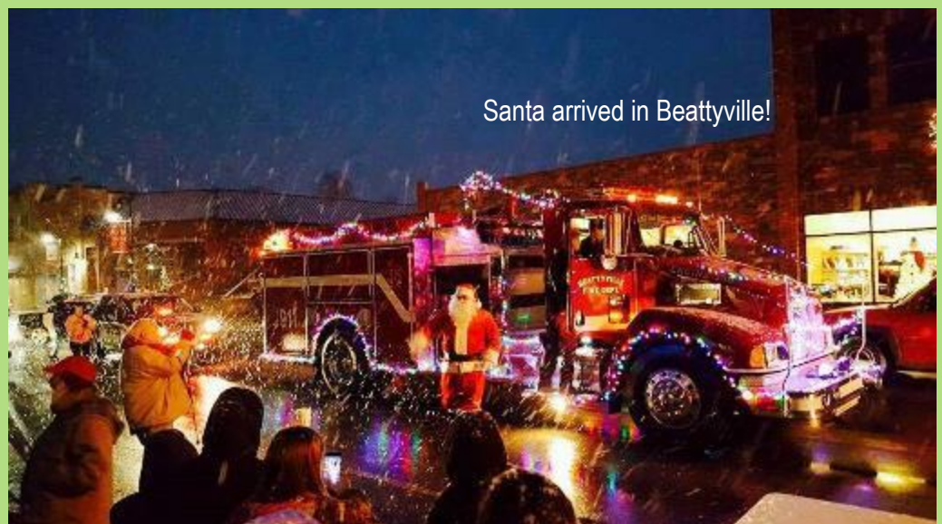
Santa arrived in Beattyville!

Thank you for all you do in your KYMS communities!