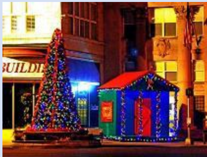
Downtown Middlesboro at Fountain Square, 20th St & Cumberland Avenue.

Congratulations! The Downtown Beattyville Alliance was recently awarded a $1000.00 "CSX Beyond Our Rails" grant. The funding is to be used for Main Street promotions and events. We would like to express our appreciation to CSX for their support of our community. #beattyville